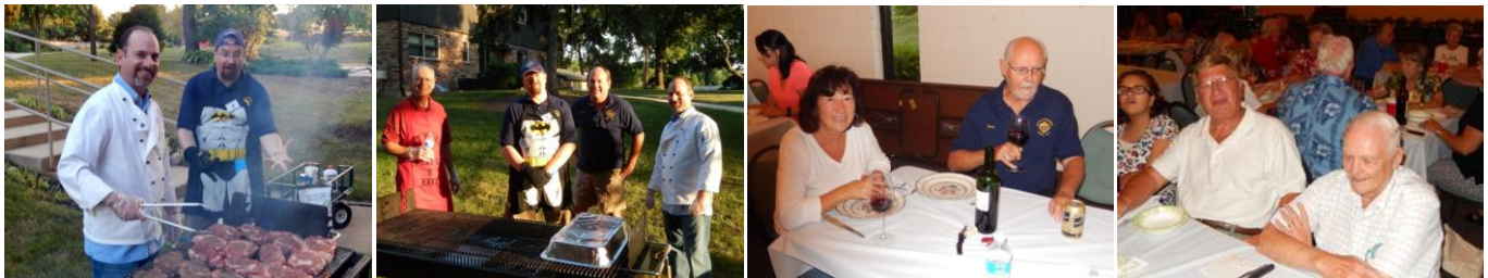
Here are some Pictures from last year's Steak Fry!