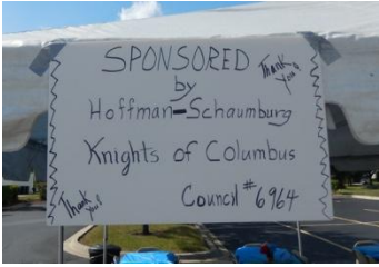
The Bingo Tent is Sponsored By Us