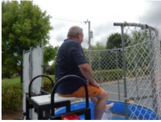
Sitting in the "Dunk Tank"